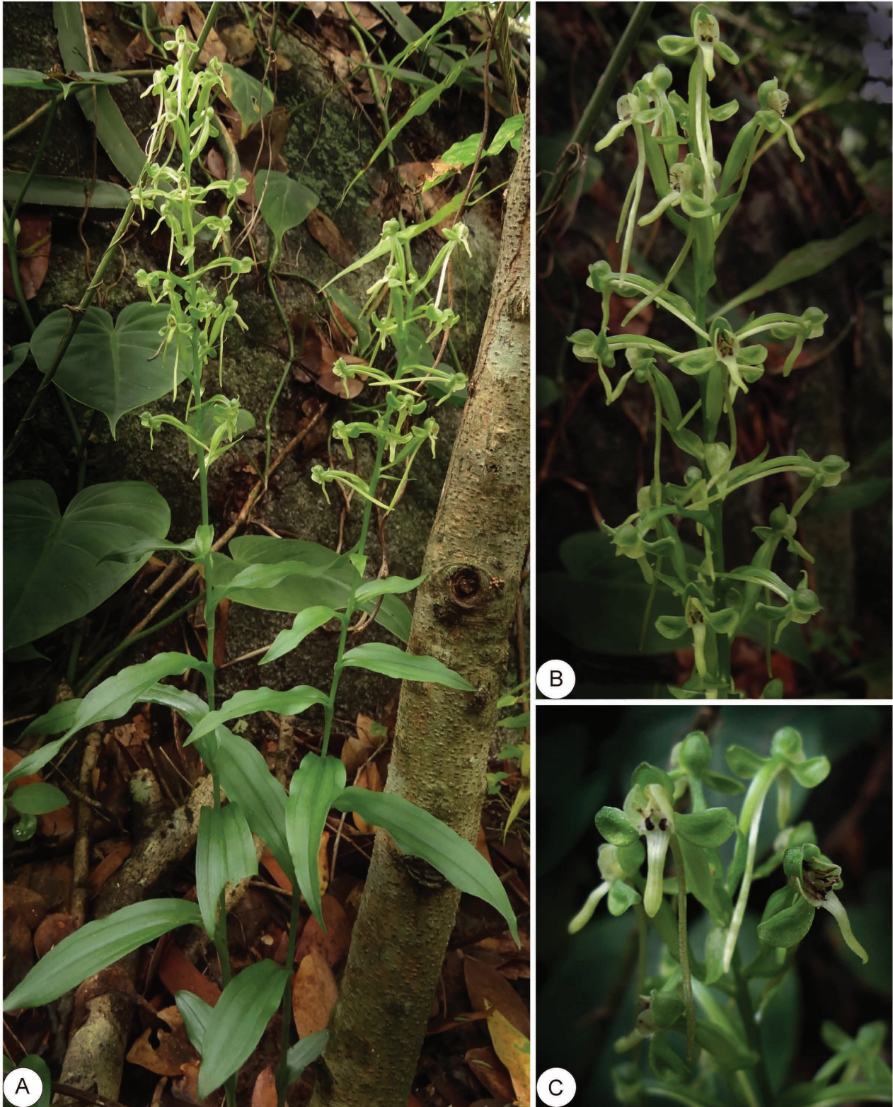
FIGURE 1. Habenaria yookuaensis Mejía-Marín, Espejo, López-Ferr., & R. Jiménez. A. Habit. B. Inflorescence. C. Flowers

Plants 35–42 cm tall including the inflorescence, terrestrial, erect, glabrous. Roots thin, ca. 2 mm diameter. Tuberoid not seen. Leaves 8–11, polystichous, sheathing, the larger ones in the middle of the stem, the lower ones reduced to sheaths, 0.5–10 cm long, 1.5–2 cm wide, with the blades 0.5–10 cm long, 1.5–2 cm wide, elliptic to narrowly elliptic, membranous, acute to acuminate, attenuate at the base, entire, glabrous, 3 veined. Inflorescence 8–15 cm long, terminal, racemose, cylindrical, rachis slightly keeled, green; floral bracts 1–2 cm long, 0.2–0.5 cm wide, lanceolate, acuminate, attenuate at the base, entire, those of the basal flowers slightly larger than the ovary, and those of the upper