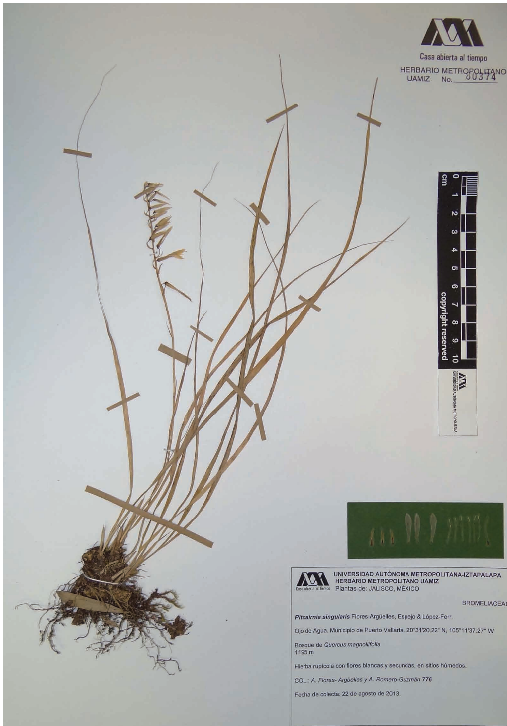
FIGURE 2. Holotype of Pitcairnia singularis Flores-Argüelles, Espejo & López-Ferr.

green, erect, narrowly triangular, 1.7–5.2 cm long, 0.37–0.74 mm wide at base; raceme 5.5–7 cm long, glabrous, 14–20 polystichously flowered; rachis wholly visible; floral bracts white-greenish, straw colored in dried specimens, narrowly triangular, long attenuate, membranous, 4–7(–10) mm long, ca. 0.7 mm wide, erect, the apex acute, glabrous; flowers secund at anthesis, slightly zygomorphic, pedicellate; pedicels linear, 1.5–6.9 mm long, flattened, glabrous except lepidote apically; sepals free, white, narrowly triangular, 9.5–11 mm long, 1.4–1.6 mm wide at the base, the two adaxial ones carinate, glabrous, acute; petals white, oblanceolate-spatulate, 1.5–1.7 cm long, 3.7–4 mm wide at widest point, without basal appendages, acute; stamens all equal in length; filaments white, strap shaped, linear, 11–12 mm long; anthers yellow, linear, 3.4–3.7 mm long, sagittate; ovary ovoid, 3–4 mm long, ca. 1.6 mm in diameter; style linear, 14–15 mm long; stigma white, conduplicate-spiral. Capsules red-brownish, ovoid, trigonous, 7.5–8 mm long, 2.5–3 mm in diameter at its widest part, apex rostrate, septicide; seeds light brown, fusiform, 1.8–2 mm long, long bicaudate.