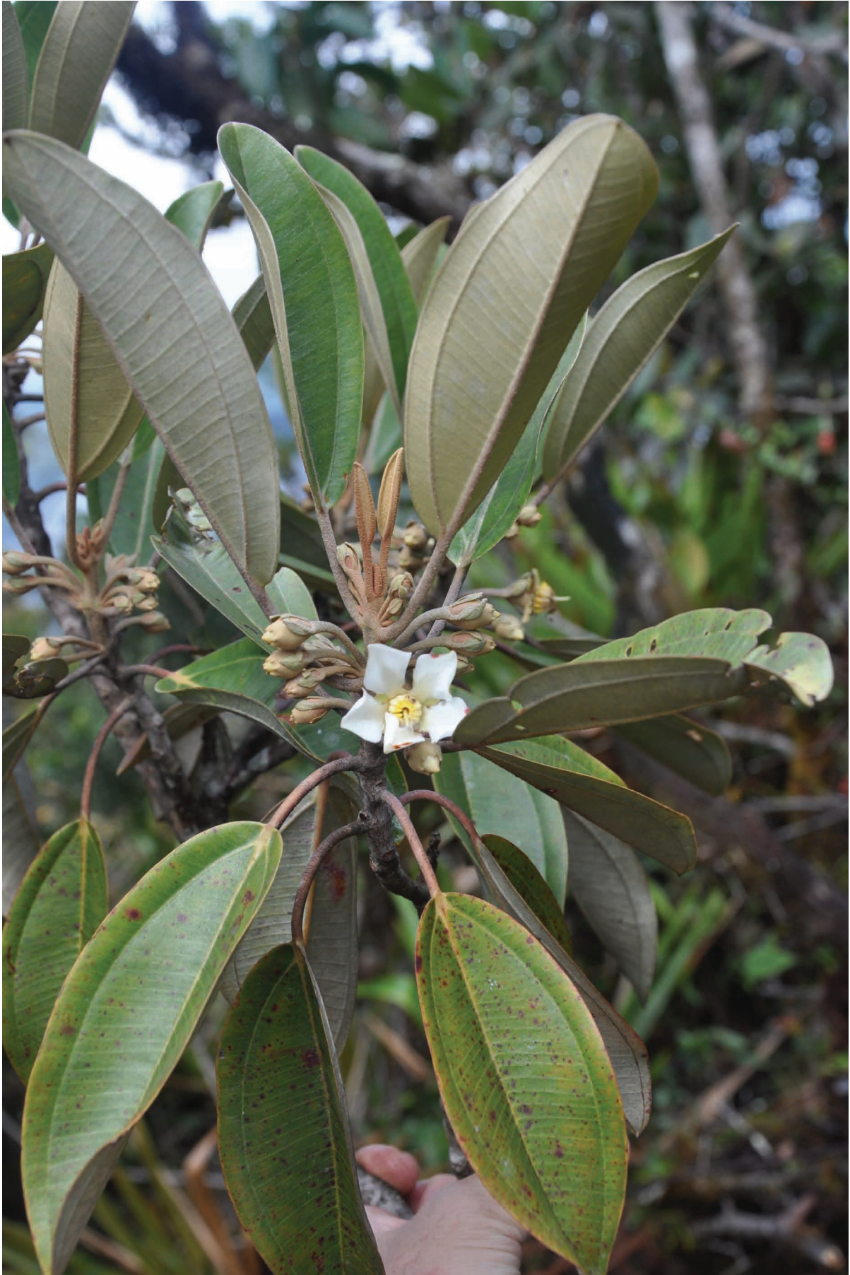
FIGURE 2. Blakea nangaritzana . Flowering branch and flower (note that anthetic flower appears 5-merous due to spider webs between two petals; 12 stamens can be counted). From Homeier 5205 .