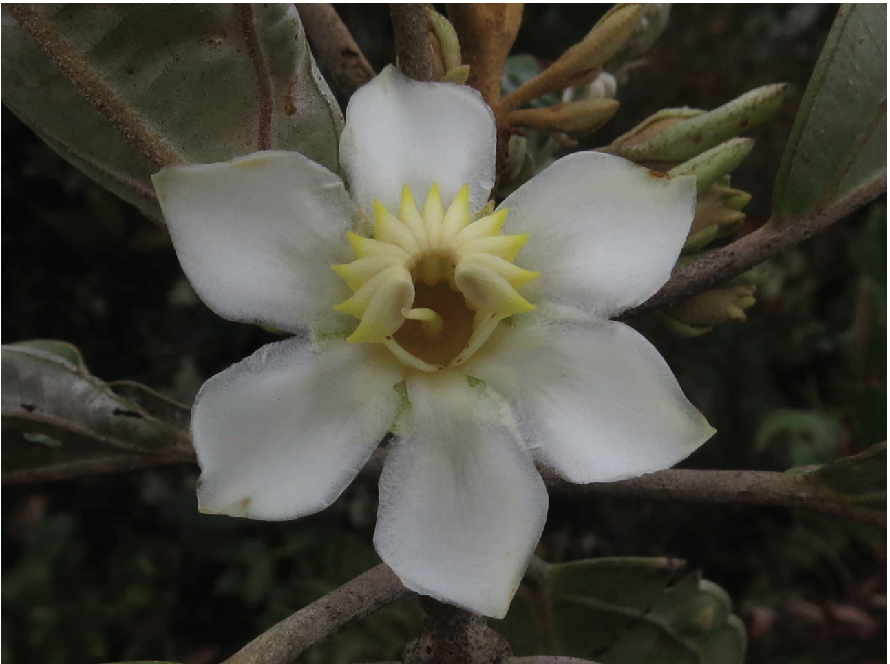
FIGURE 3. Blakea nangaritzana . Flower in anthesis.

Conservation status: —The Area of Occurrence is of 36 km 2 and the Extension of Occurrence (EOO) of 20 km 2 . The species has been collected over a 30 year period, but remained undescribed until now, stressing the importance of long-term exploration, detailed studies, well-maintained herbaria, and most importantly, well conserved forests. Based on our current knowledge, we assigned this taxon a provisional IUCN (2012) conservation status of Endangered (EN) because of the small size of the population.