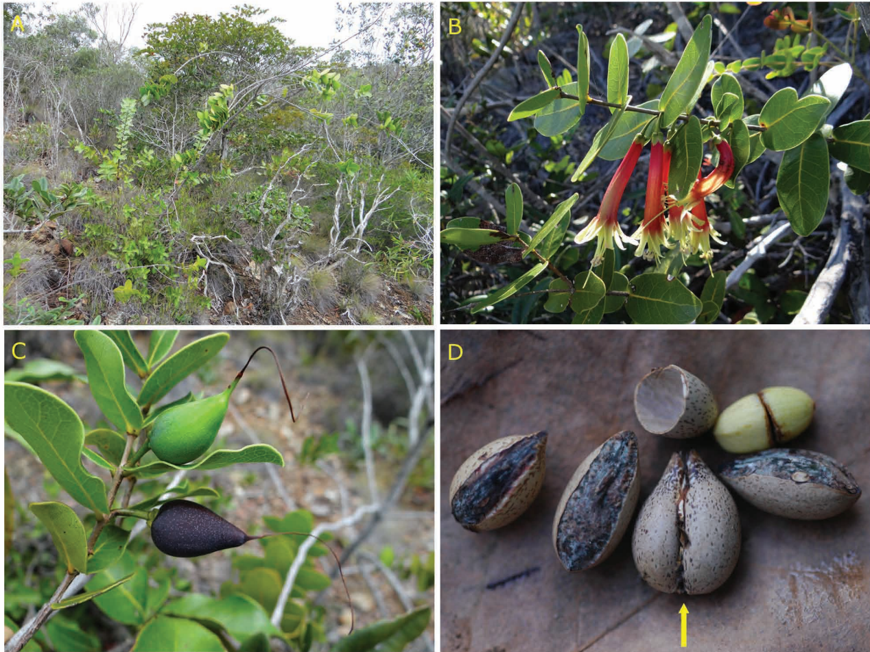
FIGURE 1. Pycnandra longiflora , A. Habit of open maquis, B. Flowering branch, C. Fruits with long persistent styles, D. Seeds from one- or 2-seeded (arrow) fruits. Pictures A–C from Rosa Scopetra, D from Jérôme Munzinger.

Pycnandra longiflora (Benth.) Munzinger & Swenson, Austral. Syst. Bot. 28: 101 (2015) (Fig. 1)