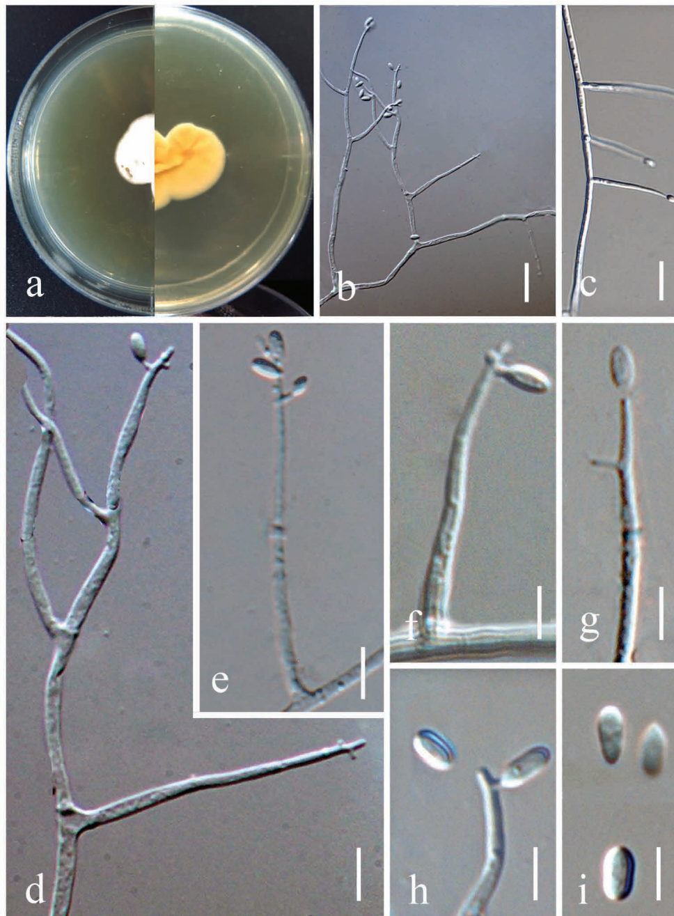
FIGURE 3. Calcarisporium cordycipiticola (ex-type CGMCC 3.17905, MFLUCC 15-0686) a. Surface (left) and reverse (right) of colony of Calcarisporium cordycipiticola on PDA medium 10 days at 20 °C. b, c, d, e, f, g. Conidiophores with conidia; h, i. Conidia. Bars: b, c, d, e, f, g = 10 µm; h, i = 5 µm.

Parasitic with white mycelium forming a cottony layer on the stromata of Cordyceps militaris . Colonies on PDA reaching 18–22 mm diam. at 20 °C after 10 days. Hyphae 2–3 µm wide. Conidiophores 18–70 × 1–3 µm, erect, hyaline, verticillate, with 1–5 verticils, each verticil with 1–15 conidiogenous cells. Conidiogenous cells 15–70 × 1.2–3 µm, gradually tapering near the apex, conidiogenous denticles 2–2.5 µm long. Conidia 3–5 × 1.5–2.5 µm, holoblastic, unicellular, hyaline, smooth-walled, thin-walled, ovoid, navicular or fusiform, base acuminate.