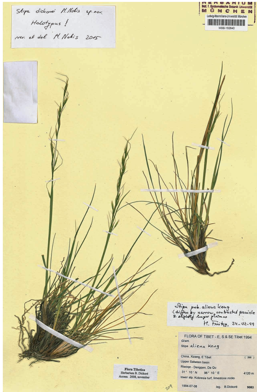
FIGURE 1. Holotype of Stipa dickorei .

10.0–12.5 mm long, lanceolate, tapering into a delicate hyaline apex, glabrous on dorsal line. Anthercium 8.0–9.2 mm long, 0.7–0.9 mm wide. Callus 1.0–1.3 mm long, sharply pointed, densely long-pilose, hairs 0.5–0.9 mm long; base of callus dorsally flattened and long protruding, peripheral ring 0.25–0.30 mm in diameter, scar broadly elliptic. Lemma pale green, on dorsal surface covered by numerous hooks and scattered ascending hairs 0.4–0.7 mm long, top of lemma with coronula of hairs 0.4–1.0 mm long. Awn 20–26(–32) mm long, bigeniculate; column 5–7 mm long, twisted, 0.2(–0.3) mm wide, green or straw-coloured, pilose, hairs (0.2–)0.5–1.0(–1.3) mm long, gradually decreasing in length towards the geniculation; the middle segment of the awn 3–5 mm long, pilose, hairs (0.1–)0.2–0.3 mm long; seta straight, green or purple, 11–15 mm long, hairs on seta 0.1–0.2 mm long. Palea equal to lemma in length, with scattered hairs on dorsal surface. Anthers yellow or purple, glabrous, 3–4 mm long.