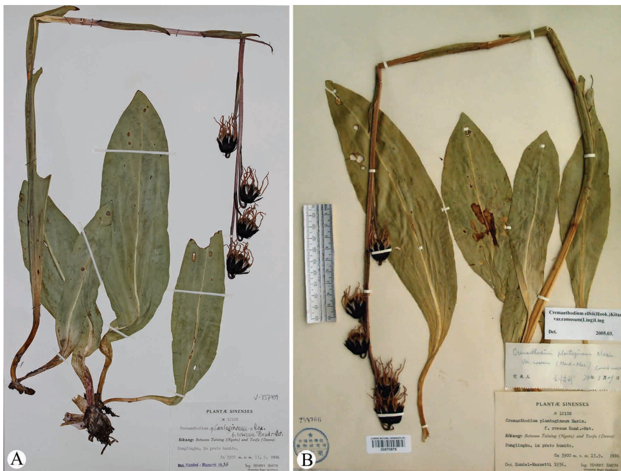
FIGURE 1. Type specimens of Cremanthodium brunneopilosum var. roseum (= C. plantagineum f. roseum ). A. China, Sichuan, Dawu, H. Smith 12108 (UPS, holotype). B. H. Smith 12108 (PE, isotype).