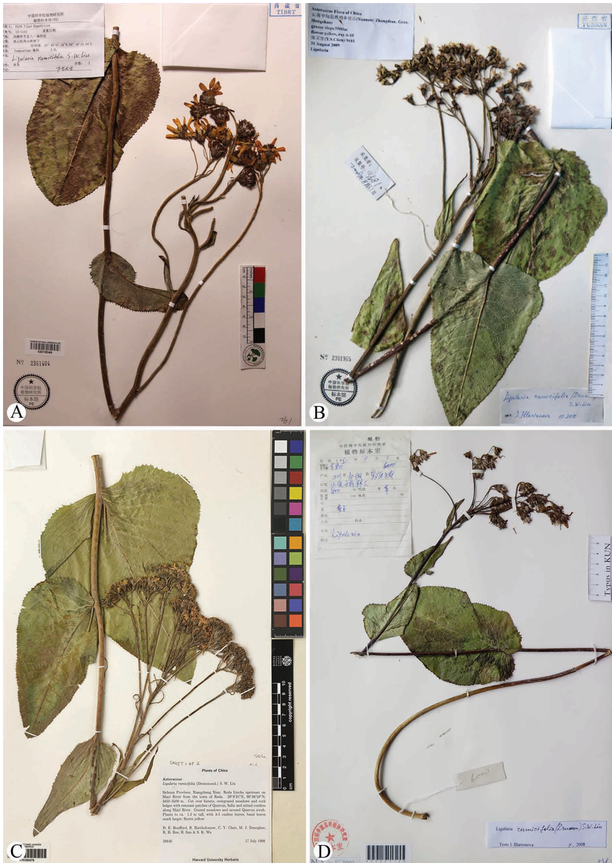
FIGURE 4. Specimens of Ligularia leescotal (previously misidentified as L. rumicifolia ). A. China, Xizang, Nyingchi, FLPH Tibet Exped. 12-1152 (PE). B. China, Yunnan, Zhongdian, Y.S. Chen 9681 (PE). C. China, Sichuan, Xiangcheng, D.E. Boufford et al. 28846 (E). D. China, Sichuan, Daocheng, Qinghai-Xizang Exped. 6000 (PE).