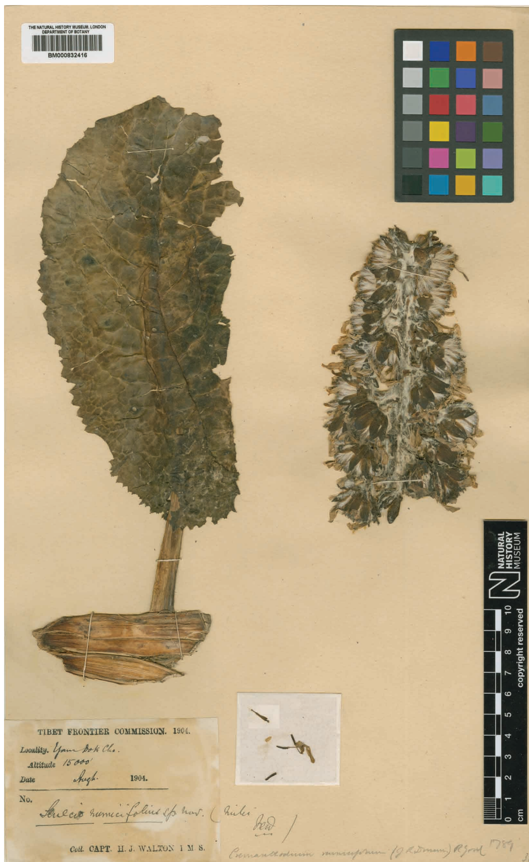
FIGURE 3. Isotype sheet of Ligularia rumicifolia .

Ligularia ghatsukup Kitamura (1953: 73), syn. nov.