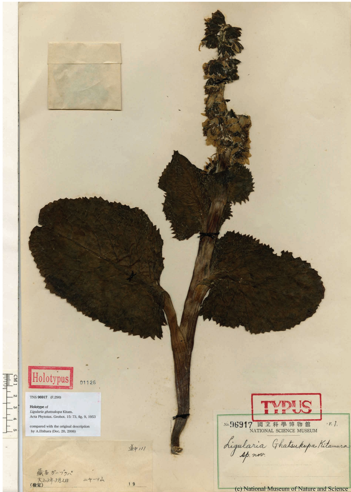
FIGURE 1. Holotype sheet of Ligularia ghatsukupa .

(1975) and Kitamura (1982) recognized this species, but Liu (1985a, 1989) and Illarionova (2006, 2008b) placed it in synonymy within L. rumicifolia Drummond (1911: 271) Liu (1985a: 832), and Liu & Illarionova (2011) placed it in synonymy within L. rumicifolia Liu (1985a: 832). Further on, we will discuss the problem of the author citation of L. rumicifolia .