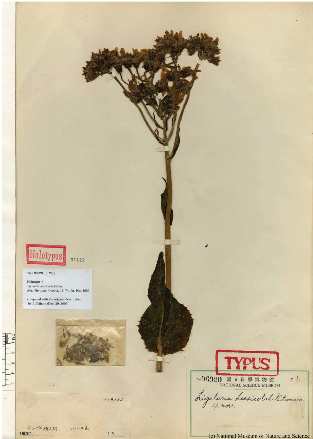
FIGURE 2. Holotype sheet of Ligularia leescotal .

Senecio rumicifolius Drummond (1911: 271) was described on the basis of a single collection, Walton s.n. (BM, K; Fig. 3), from Yamdokcho, Nagarzê, Xizang, China. In the protologue, the author stated that the species was very