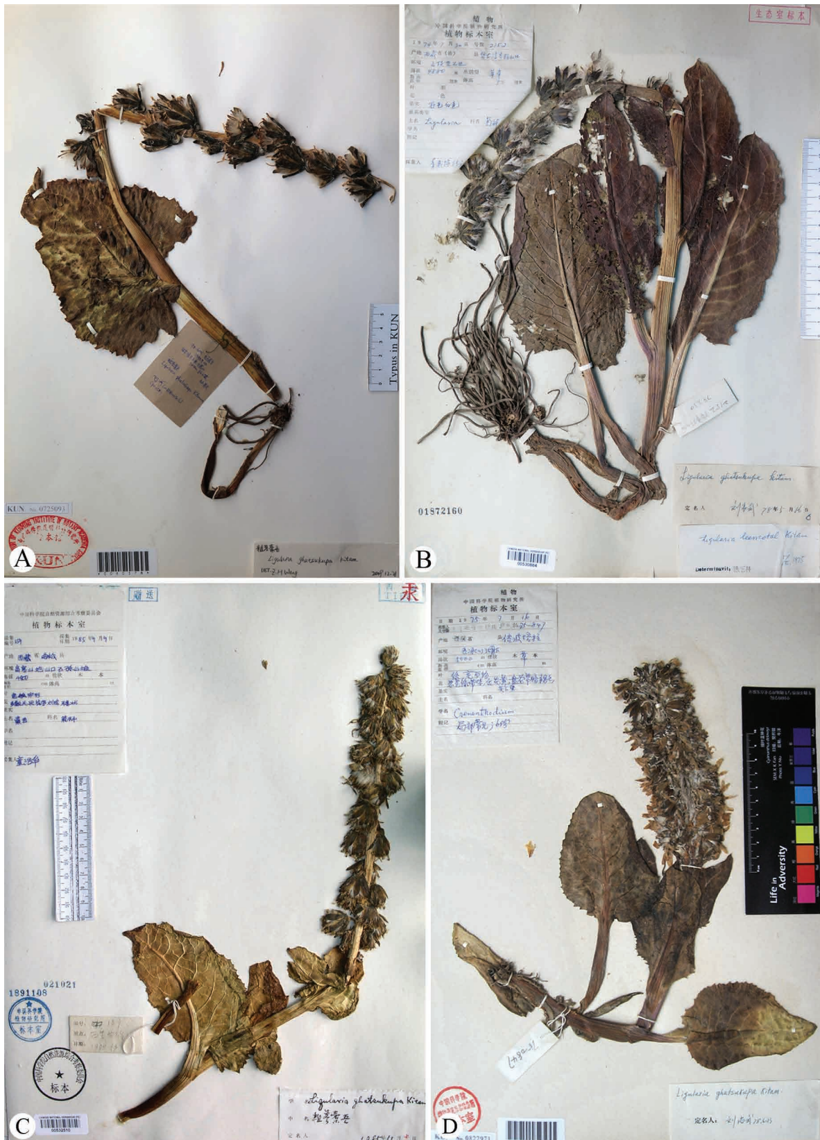
FIGURE 5. Specimens of Ligularia rumicifolia (previously misidentified as L. ghatsukupa ). A. China, Xizang, Nagarzê, J.S. Yang 90-600 (KUN). B. China, Xizang, Comai, Qinghai-Xizang Veg. Exped. 2152 (PE). C. China, Xizang, Qusum, H.H. Tong 159 (PE). D. China, Xizang, Without precise locality, C.Y. Wu et al. 75-847 (KUN).

Additional specimens examined: —CHINA. Sichuan: Daocheng, Qinghai-Xizang Exped. 6000 (KUN); Xiangcheng, D.E. Boufford et al. 28846 (E, P), 43184 (PE). Xizang: Banbar, D.D. Tao 11221 (KUN, PE); Baxoi, C.Y.