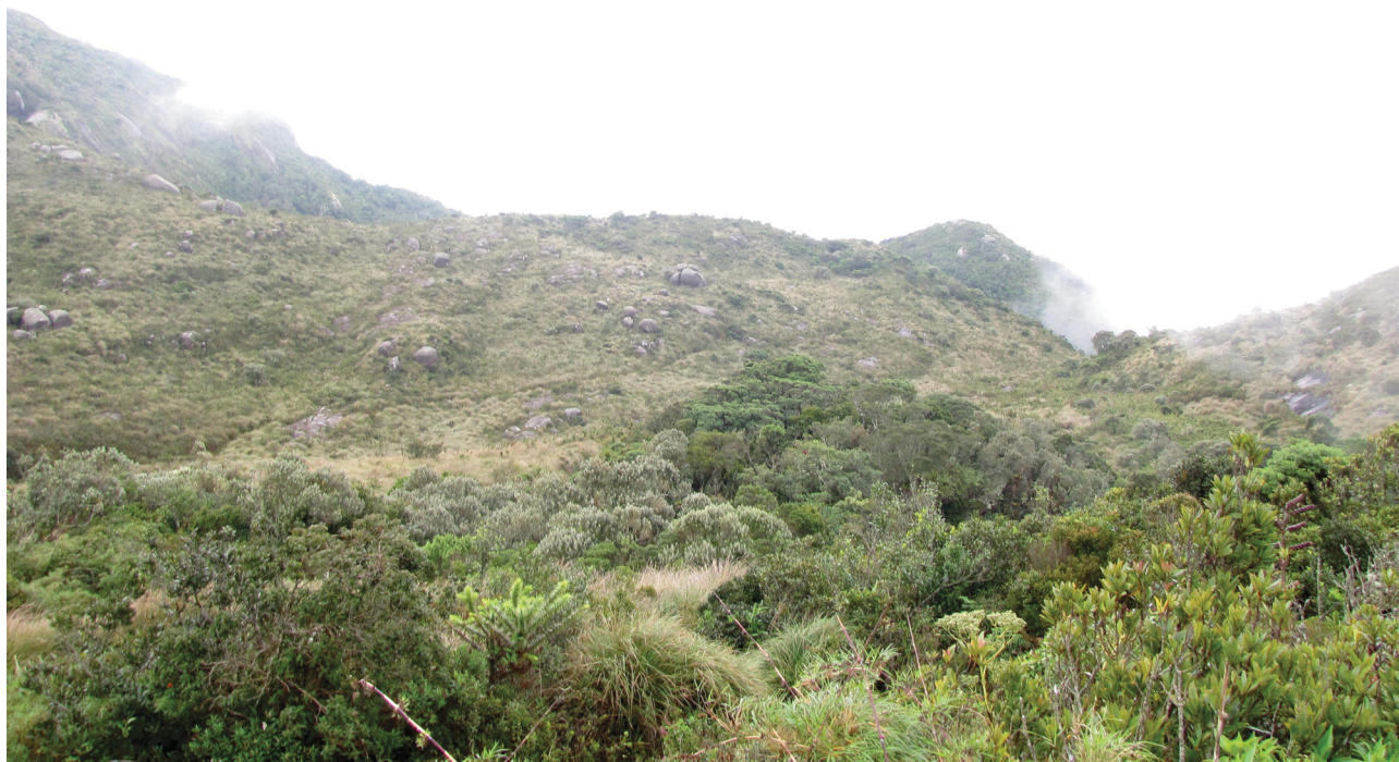
FIGURE 1: The habitat of Dioscorea sphaeroidea in high-altitude grasslands of Serra dos Órgãos National Park, southeastern Brazil.

CUVC, CVRD, ESA, F, FCAB, FURB, GUA, HAL, HAS, HB, HCF, HRCB, HUCP, HUEFS, HUPG, HVASF, HXBH, IAC, ICN, INPA, IPA, IRBR, JE, JVR, K, L, LPS, M, MBM, MEXU, MG, MNHN, MO, MVFA, MVFQ, MVM, NY, P, PACA, PEL, PH, RB, RBR, RFA, RFFP, S, SMDB, SP, SSUC, U, UFP, ULS, UNR, UPGB, US, UV, WU, XAL, Z and ZT. The preliminary risk assessment was based on the IUCN Red List Categories and Criteria (IUCN 2001).