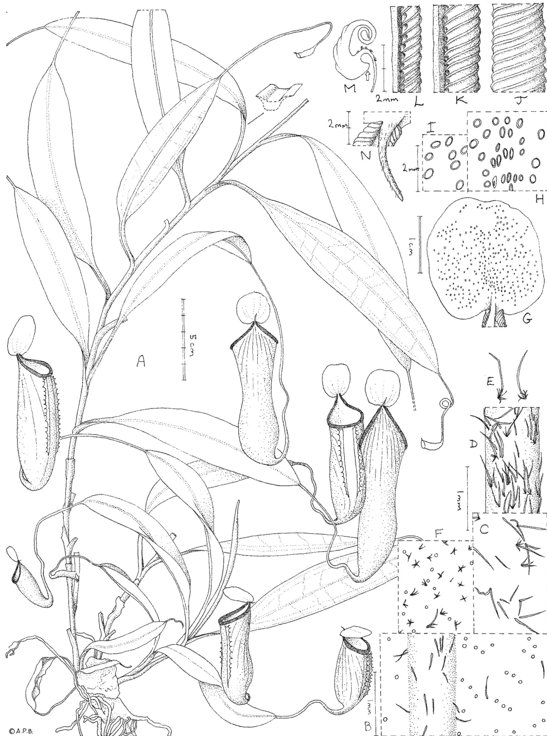
FIGURE 2. Nepenthes cid A habit, showing the whole plant, with woody rootstock; B lower surface of leaf-blade showing simple hairs and sessile globose glands; C stem, showing hairs; D tendril, showing hairs; E detail of D showing individual 'dagger hairs'; F outer surface of pitcher showing minute stellate hairs; G lower surface of pitcher lid; H nectar glands from midline of lid; I nectar glands from near periphery of lid; J peristome, viewed from above; L & K peristome, after dissection, rolled back to expose inner edge with holes (normally concealed); M peristome, transverse section, outer edge to right; N junction of lid and peristome, with spur. Scale-bars: single = 1 mm; graduated single = 2 mm; double = 1 cm; graduated double = 5 cm (drawn by A Brown from the type specimen).