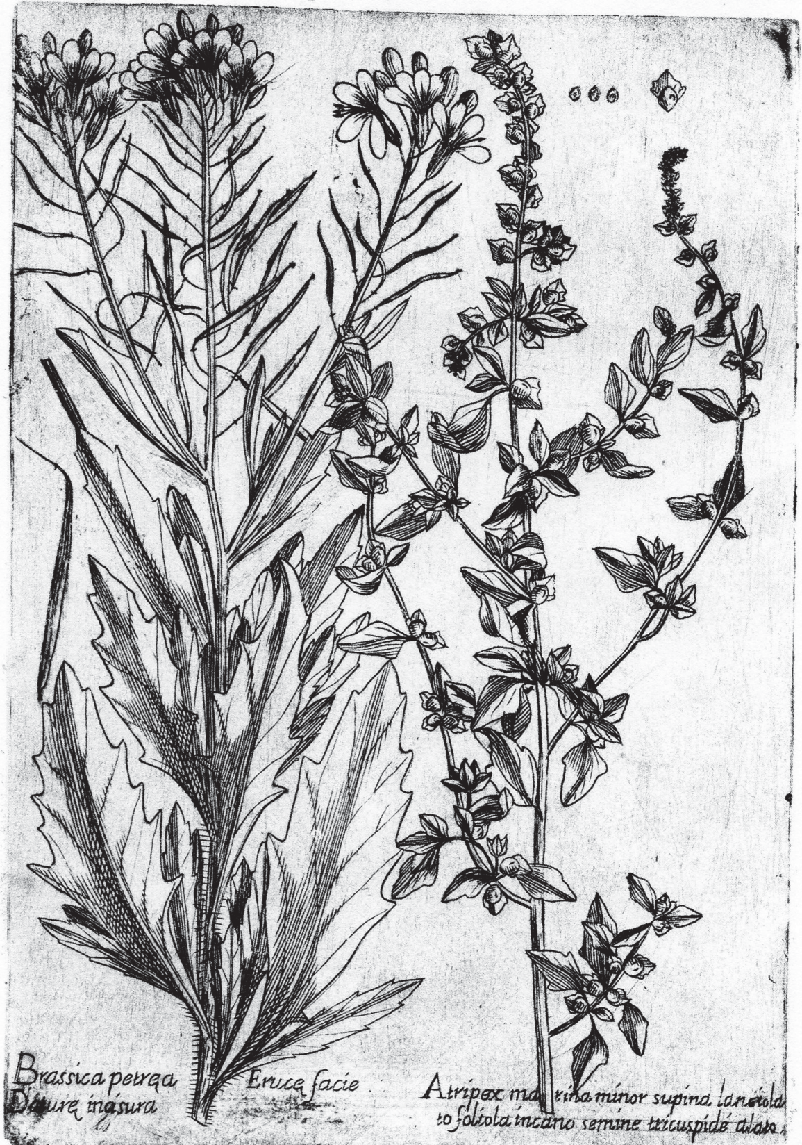
FIGURE 1. Lectotype of the name Atriplex tornabenei ( Atriplex marina minor supina lanceolata foliola incano semine tricuspidē alata , T. III from Cupani 1713).