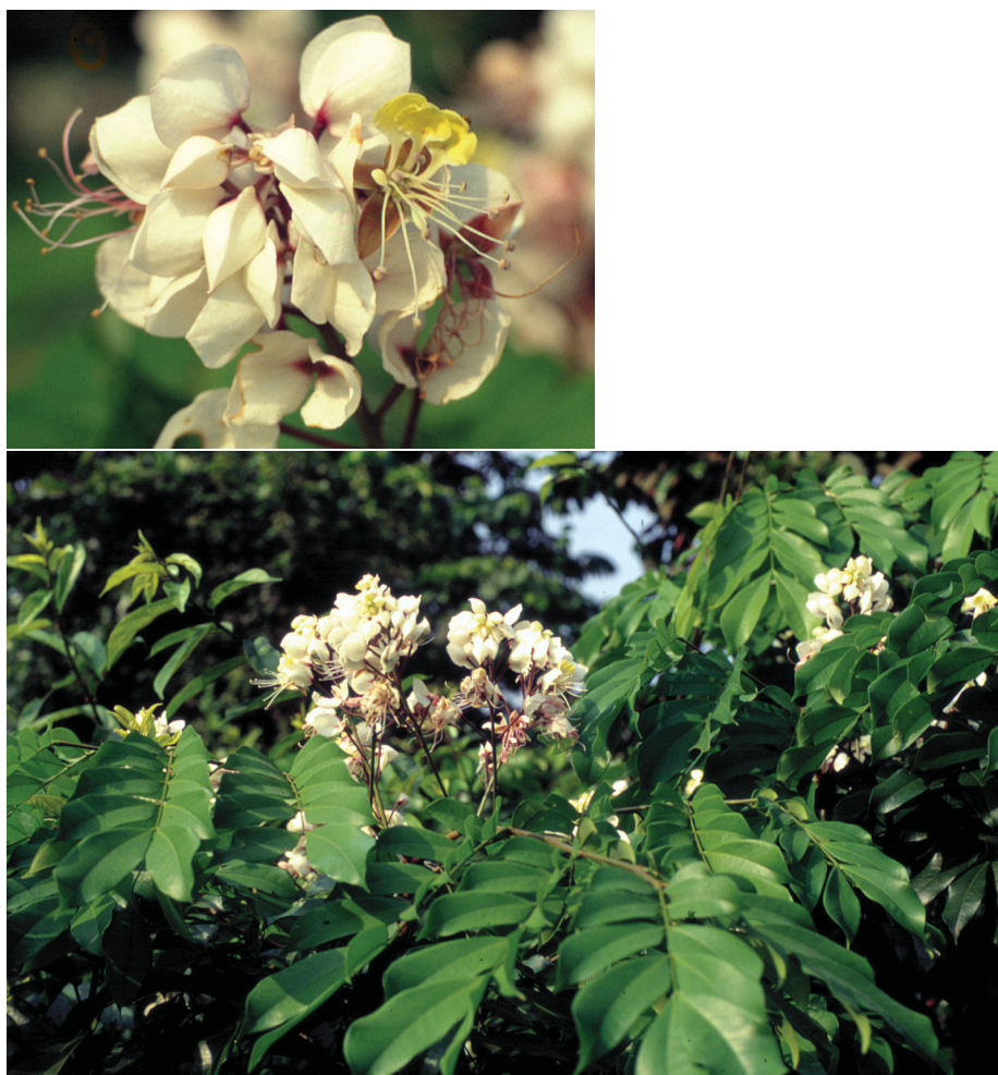
FIGURE 1. Flowering branch of Gabonius ngouniensis with close up of inflorescence (upper) to show petal development, shape and colour in an opened flower.