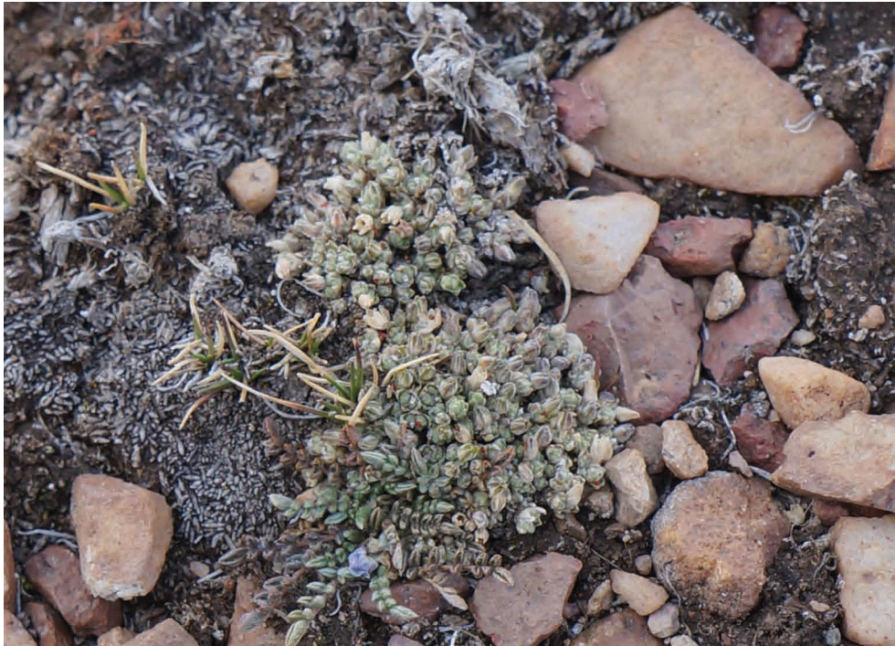
FIGURE 2. Habit of Arenaria acaulis (along road between Matazo and Querala, Ubinas district, at 4584 m).

Taxonomical notes: —The new species is unique among the Neotropical Arenaria because of its dense cover of trichomes and the tufted, cushion-like habit. A. acaulis most closely resembles A. boliviana (Williams 1898: 425) MacBride (1936: 597–598). It differs by its shorter stem and internode length, the short branches being ciliate; the leaves ovate and densely covered by long trichomes; pedicels shorter or equal to the size of the calyx, sepals broadly ovate and densely covered with trichomes, and by the presence of petals.