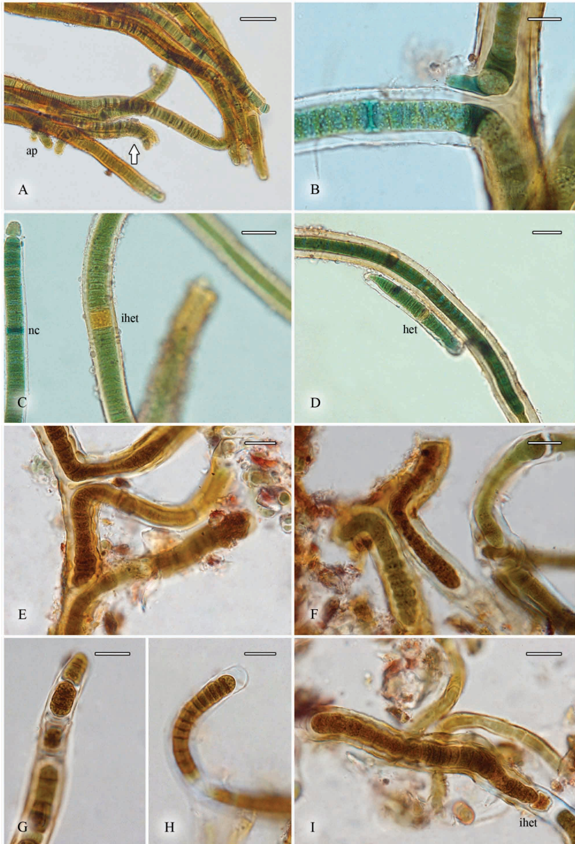
FIGURE 2. A–D. Brasilonema sp. A. Filaments densely fasciculate. B. False branches. C. Intercalary heterocyste. D. Development of isopolar hormogonia. E–I. Myochrotes sp. E. Geminate and simple false branches. F. Filaments constricted, densely entangled and widening towards ends. G. Hormogonia in a row. H. Closed apex closed prior to hormogonia liberation. I. Isopolar filament with variations in diameter. Arrow pointing at crescent-shape hormogonia, ap = apical cell, nc = necridic cell, ihet = intercalary heterocyste. Scale bars: A = 20 \mu m, D = 20 \mu m, B, C, E–I = 6 \mu m.