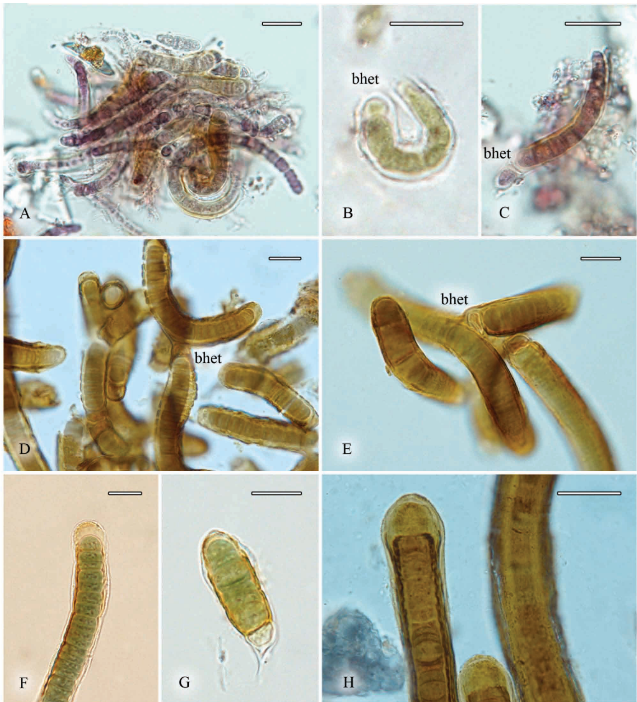
FIGURE 5. A–C. Calothrix sp. A. Entangled filaments. B, C. Curved heteropolar filaments without terminal hair, cells more or less isodiametric. D–H. Hassallia littoralis . D. Heteropolar filaments with basal heterocyte. E. Divaricated false branch with basal heterocyte. F. Closed apex. G. Heteropolar hormogonia. H. Terminal widening of the sheath. bhet = basal heterocyte. Scale bars = 6 \mu m.

Occurrence: —MEXICO. Oaxaca: San Agustín Bay, 15° 41' 17.41" N, 96° 14' 15.28" W, December 2010, October 2012 L. González-Resendiz & H. León-Tejera (C57, C695, C700, C701).