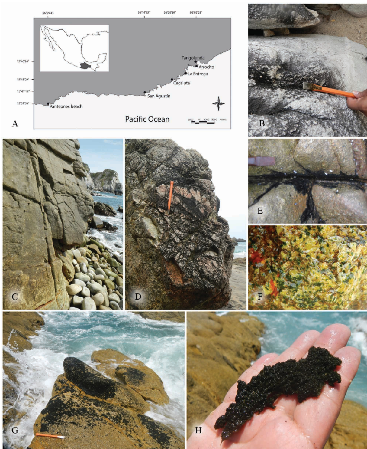
FIGURE 1. A. Map showing study area. B. Ophiotrix sp. growth at Cacaluta bay. D. Hassallia littoralis growth at El Arrocito bay. E. Petalonema sp. growth at San Agustín bay. F. Kyrtothrix cf. maculans growth at Panteones beach. G, H. Brasilonema sp. growth at Tangolunda bay. B, C, D. Supratidal environments. E, F, G. Intertidal environments.

Sample processing: —Observations and micrographs were made with an Olympus BX51 microscope equipped with a DP12 digital camera. Measurements ( n=30 ) were obtained using SigmaScan Pro© software, automated image analyses (Jandel Scientific, Sausalito, CA). Morphological identification was done in accordance with traditional reference works for Cyanoprokaryotes (Frémy 1929, Geitler 1932, Komárek 2013) and several papers that report tropical and subtropical rocky shore cyanoprokaryote taxa (Umezaki 1961, Whitton & Potts 1979; Sant’Anna 1995, 1997, Thajuddin & Subramanian 1992, Nagarkar 2002, Montoya-Terreros 2003). Systematic arrangement was done using the system of Komárek et al. (2014).