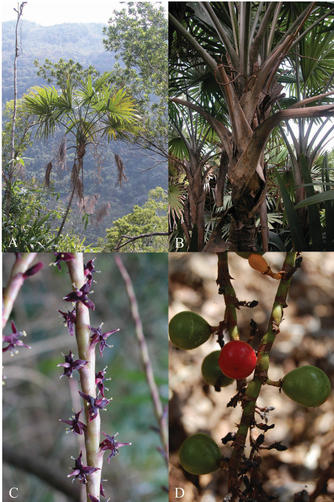
FIGURE 1. Chuniophoenix hainanensis . A. Habit, Diao Luo Shan, Hainan (Guo et al. 142). B. Leaf sheaths showing split below petiole (cultivated, South China Botanical Garden). C. Staminate flowers, Diao Luo Shan, Hainan (Guo et al. 142). D. Fruits (cultivated, Singapore Botanical Garden).