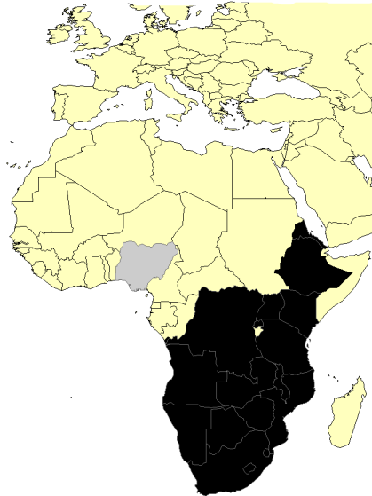
FIGURE 3. Global distribution of Schoenoplectus muricinux in its expanded circumscription. Black and grey color indicates native and (presumably) introduced range respectively.

Native in Southern Africa (Botswana, Lesotho, Namibia, South Africa and Swaziland), South Tropical Africa (southern Angola, Malawi, Mozambique, Zambia and Zimbabwe), West-Central Tropical Africa (Democratic Republic of Congo and Rwanda), East Tropical Africa (Kenya, Tanzania and Uganda) and Northeast Tropical Africa (Eritrea and Ethiopia). Probably introduced in West Tropical Africa (Central Nigeria: Plateau State). Based on its currently known distribution the presence of Schoenoplectus muricinux in Burundi seems likely.