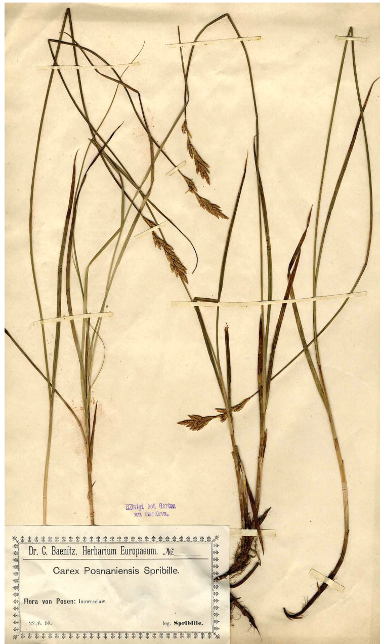
Fig. 2. Herbarium voucher of Carex posnaniensis from 1898. After morphological verification by W. Żukowski and T. Egorova and molecular analysis this taxon is currently recognized as Carex repens .