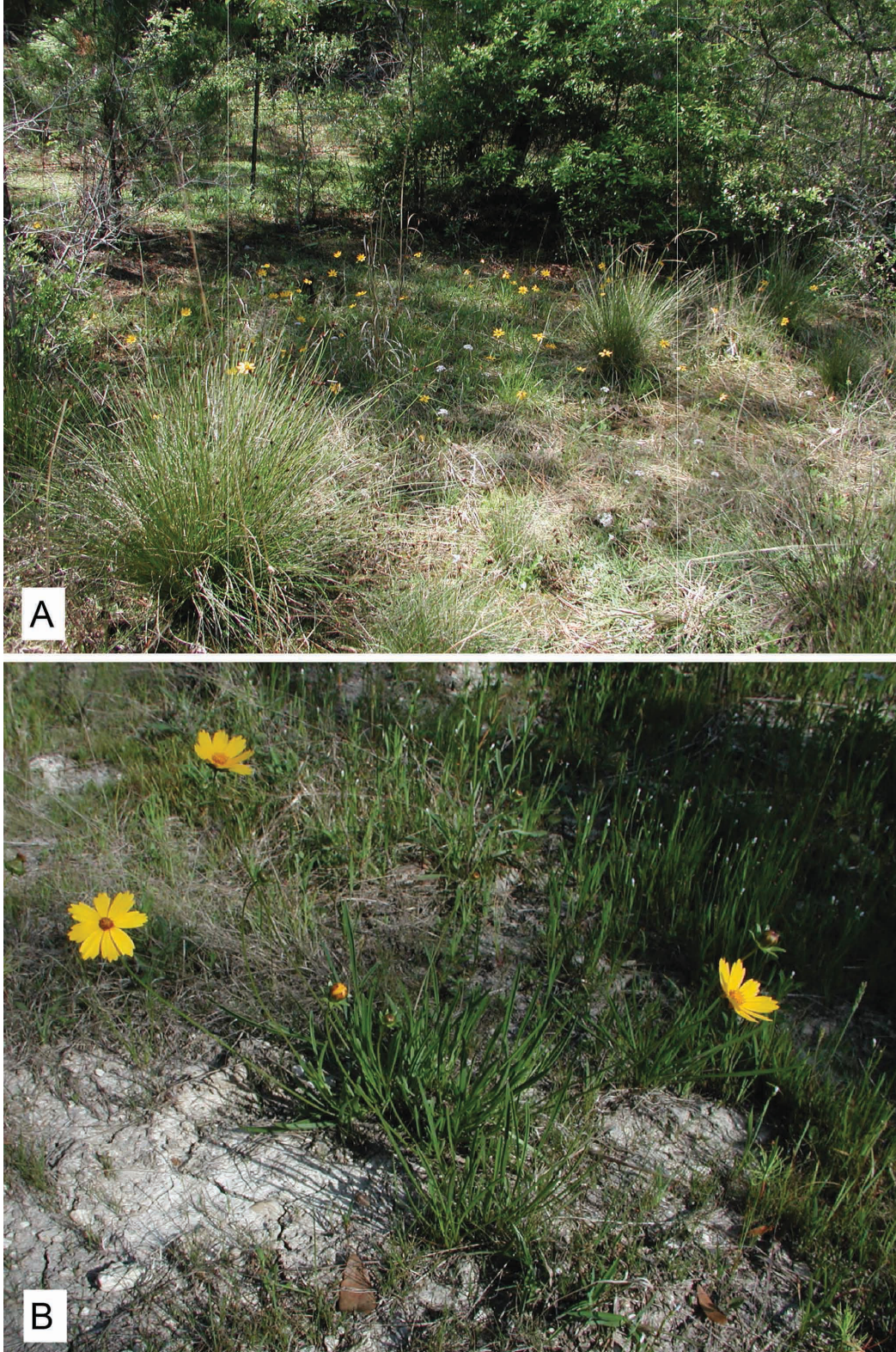
FIGURE 2. A–B. Coreopsis bakeri . A. Habitat, with blooming plants. B. Plants in bloom, showing substrate with exposed bare rock.