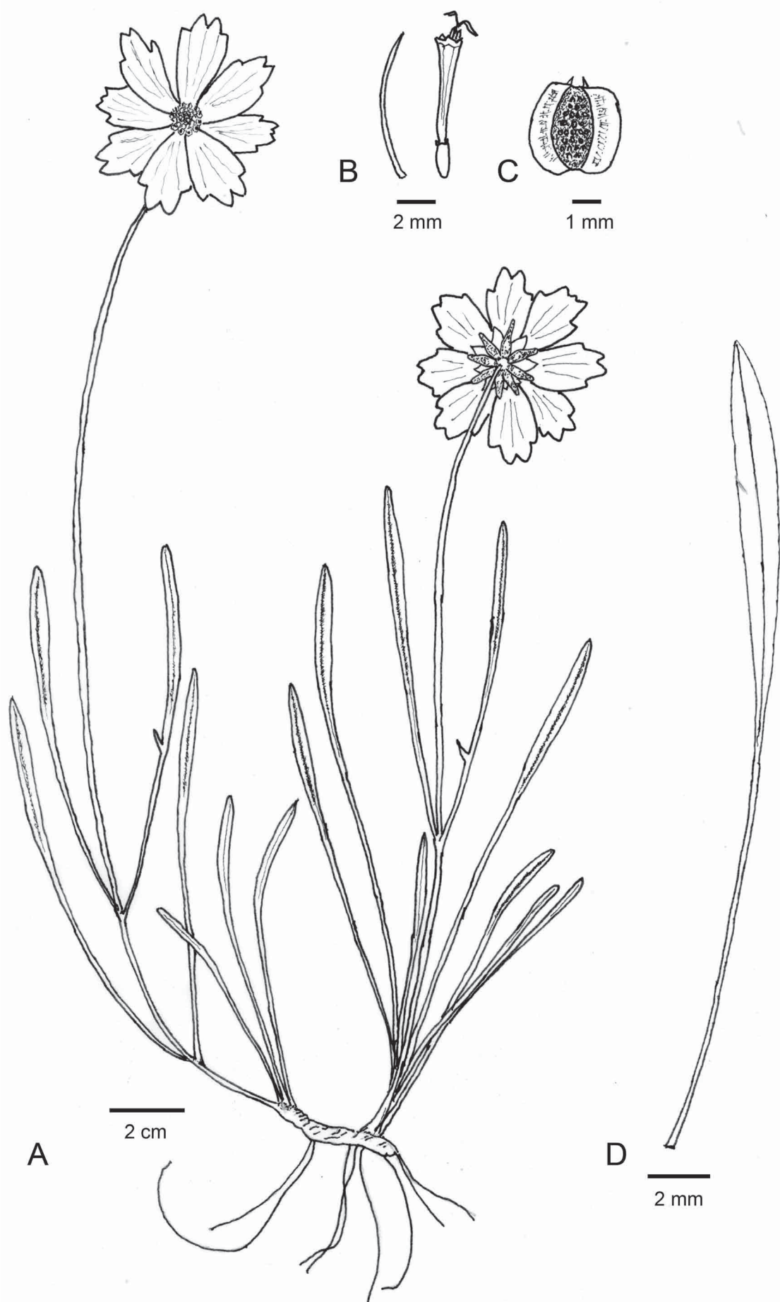
FIGURE 1. A–D. Coreopsis bakeri . A. Habit. B. Pale, Disk flower. C. Cypsela (achene). D. Leaf.