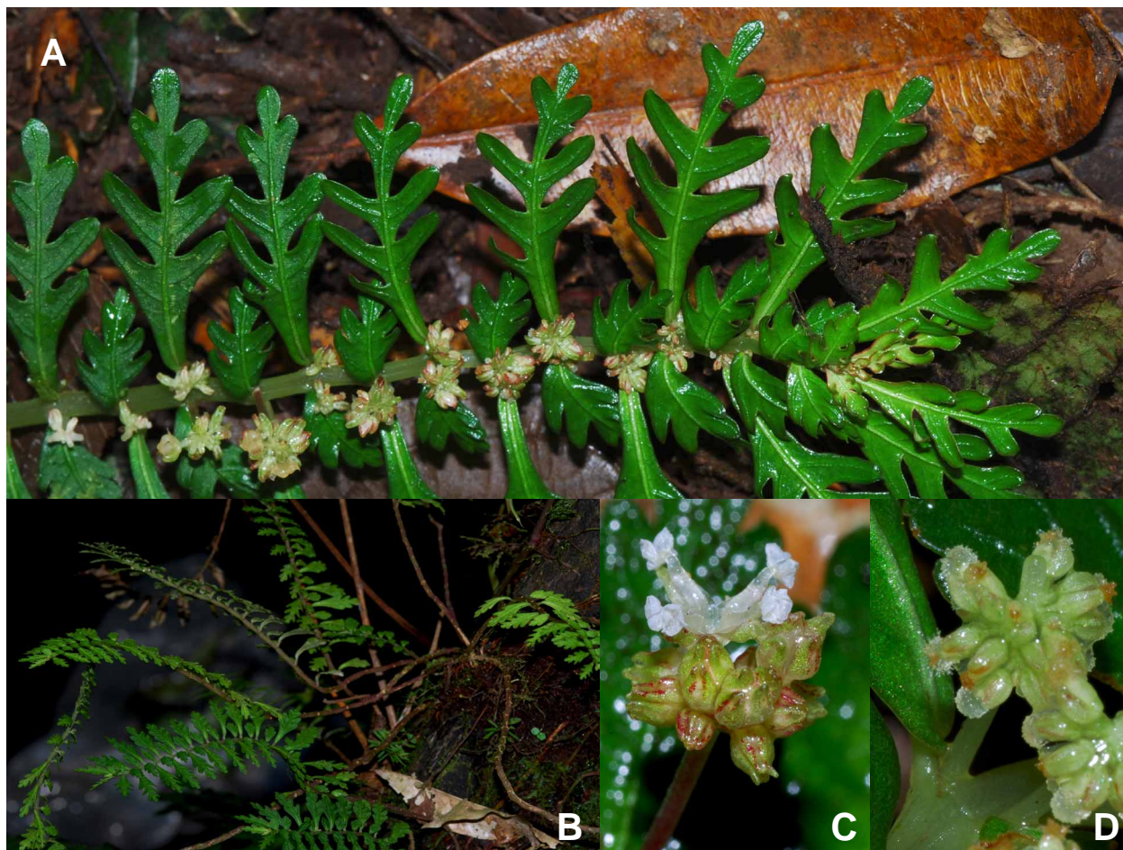
FIGURE 1. A. Disposition of leaves and inflorescences, Monro & Solano 5770 (Photo A.K. Monro). B. Habit in the field habit, Monro & Solano 5848 (Photo A.K. Monro). C. Staminate inflorescence with flower at anthesis, Monro & Santamaría 5761 (Photo A.K. Monro). D. Pistillate inflorescence with receptive flowers, Monro & Solano 5808 (Photo A.K. Monro).

Type: —Costa Rica, Limón, P.N. La Amistad, Cuenca del Río Banano, Fila Matama, buffer zone for Parque Nacional La Amistad, ‘La Ventana’, 09°48’56.4120”N, 83° 09’49.3560”W, 1200 m, A.K. Monro & D. Solano 5808 (INB!-holotype; BM!, CR!, PMA!, MO!).